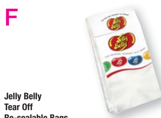
F Jelly Belly Tear Off Re-sealable Bags. 1,000 bags (four packs of 250).