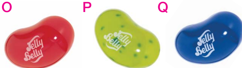
Jelly Belly Plastic Wall Beans Very Cherry, Juicy Pear, Blueberry Measures 39cm wide Easy to install Brackets on back allows you to position beans at any angle