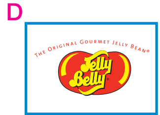
D 10" Transparent Jelly Belly Stylized Logo Poster. 3-colour, 28cm x 28cm.