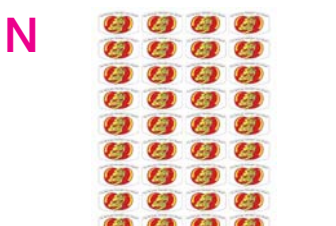
N Jelly Belly Stylized Logo Stickers 3 colour 36 per sheet 4.8cm (one size)