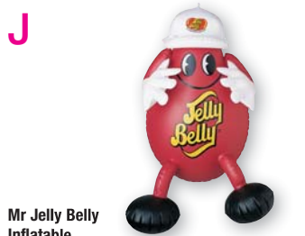
J Mr Jelly Belly Inflatable. Air inflatable 24" tall character sits on a shelf or display unit or may be hung from a ceiling fixture with enclosed hook and string.