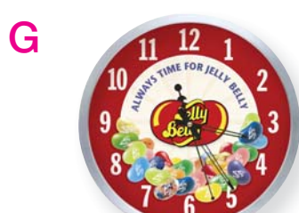
G Jelly Belly Clock Fun bright colours. Metal & plexiglass construction. Diameter: 36cm Battery included