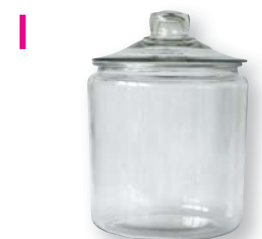
I Old Fashioned Glass Candy Jars. Diameter 17cm, height 25cm. Singles.