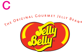
C 10" Transparent Jelly Belly Stylized Logo Stickers. 3-colour, ideal for plexiglas dispensers.