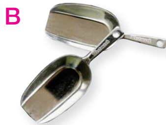
B Jelly Belly Mini Sampling scoops Custom designed polished aluminium scoop.