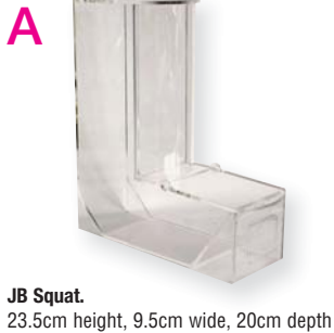
A JB Squat. 23.5cm height, 9.5cm wide, 20cm depth