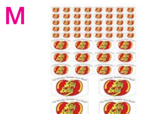
M Assorted Jelly Belly Stylized Logo Stickers 3 colour 56 per sheet (various sizes)