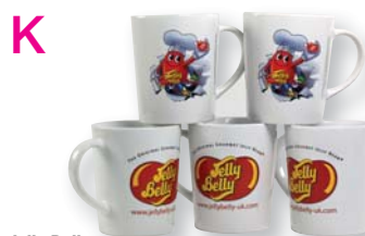
K Jelly Belly Mugs. Mr Jelly Belly featured quality white mug. Great for teaming up with a 300g Tie top, JB Twist etc. Seasonal mugs occasionally available, please enquire.