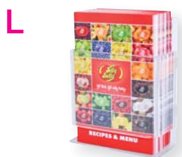
L Jelly Belly Plexiglass Menu Holder. Clear plexiglas unit; adhesive strips on back for mounting; free standing option.